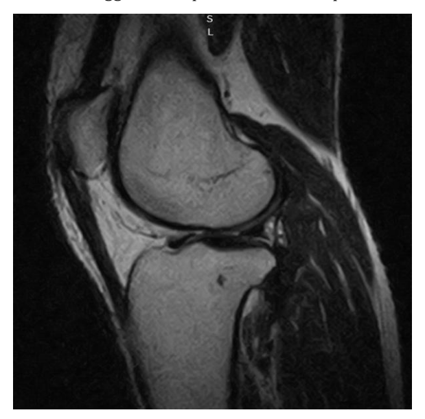
Figure 4: 12 months after AD-MSC treatment in b sagittal T2-weighted MRI T2 sequences of the in patella showed that the area was almost regenerated with good tendon morphology.

Pre-operative and post-operative clinical evaluation were collected at 6-months and 12-months follow-up using IDKC, Lysholm and Tegner scores Table 1 .