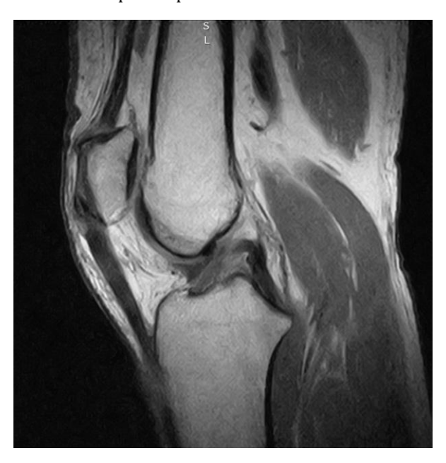
Figure 2: Radiographs of the patient's knee at 56-years-of age. sagittal T1-weighted MRI sequences showed an area of abnormality of degeneration at the inferior part of patella attachment area.

This was appropriately treated conservatively with 6 months of ice, rest, activity modification, followed by physical therapy as stretching of quadriceps and hamstrings eccentric exercise program without relief of symptoms. He quit any recreative activity for 1 year because of pain. After 1 year, we opted for adiposederived mesenchymal stromal cells (AD-MSCs) intraarticular therapy according to the procedure described by